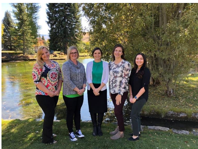
I-LEAD Class of 2020