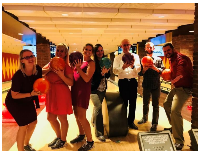
I-LEAD Class of 2019 at the Sun Valley Bowling Alley (and they all reported to have perfect 300 games)