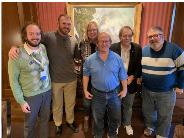
ISHP Past Presidents – Sun Valley 2019