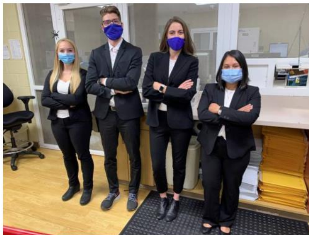
Boise VA Medical Center

Residents at the Boise VA Medical Center “twinning” on Tuesday.