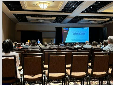
Lindsey Hunt presenting Investing in Centralized Gap Coverage Clinical Pharmacy Resources at ASHP Midyear 2022