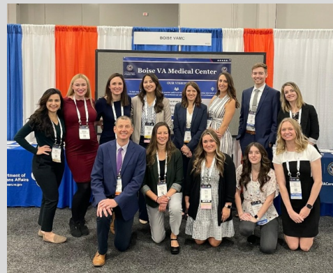
Members from the Boise VA representing their talented group at the residency showcase